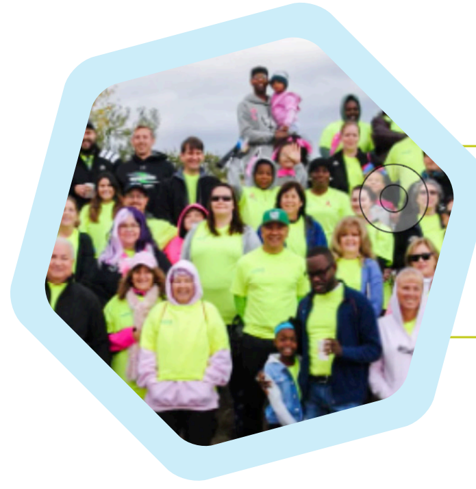
Community Impact MileOne cares about the community because it's our community too.