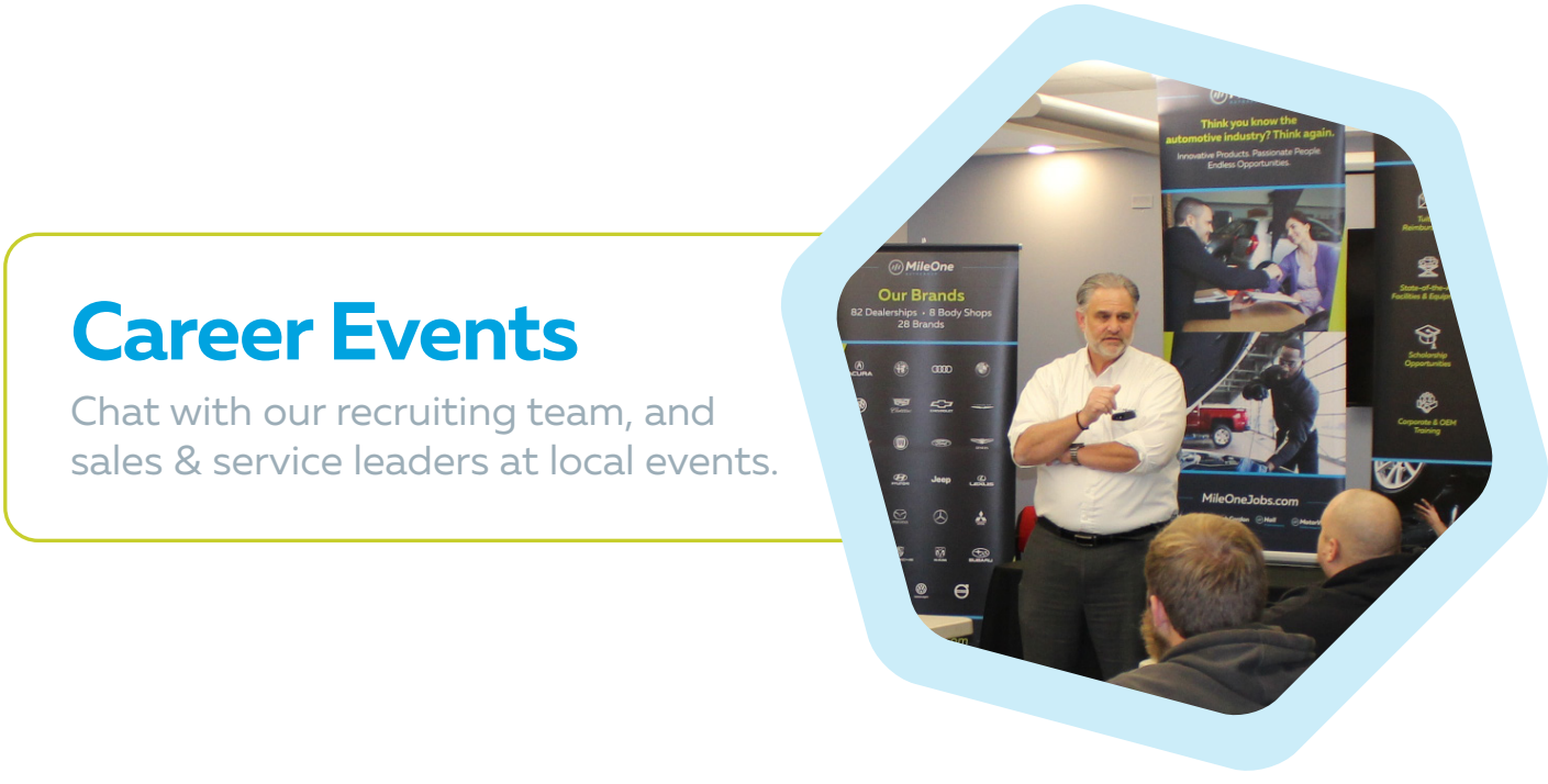
Career Events Chat with our recruiting team, and sales & service leaders at local events.

Stay Connected Join Our Talent Network »