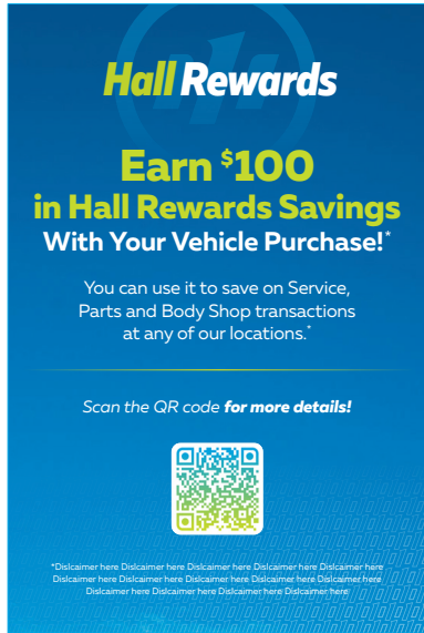
Table tent for the Showroom, Sales and F&I areas. QR code links to HallRewards.com.